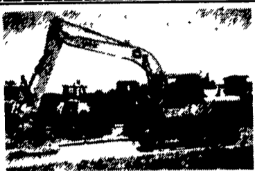
JD 490D Excavator, long stick, 24" bucket.....$35,000