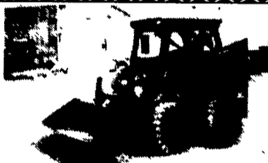
THOMAS T173 HL