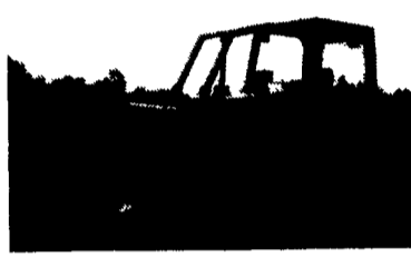
1987 Case 1155E, 3400 hours, good UC.....$30,000

1993 JD 300D Backhoe, OROPS, good rubber, 650 hrs.....$27,000