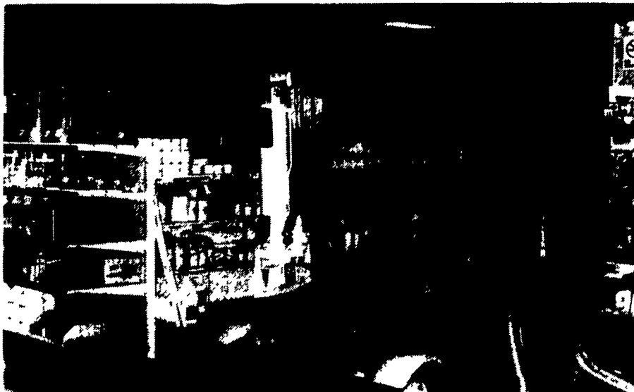
Show Room and Customer Sales Area

It is also the top Vermeer dealer in a 10-state area, according to Bill Crytzer, and is one of the largest Cub Cadet dealers in the area. It also sells White Outdoor Products and Ecco and Husqvarna chain saws.