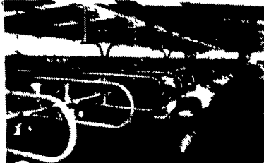
ALBERS Freestall Loops and Self-Locking stanchions in a loafing barn keeps cows comfortable