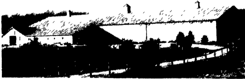
72 x 180 Indoor Arena with 20 Stall Barn

139 Churchtown Rd., Narvon, PA 17555 (717) 768-8606 (717) 768-3264 FAX