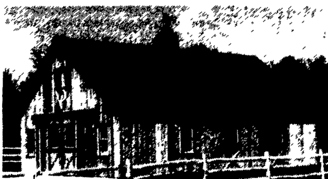
30 x 40 4- Stall Barn