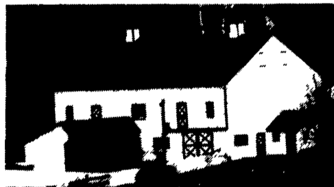
48 x 72 Bank Barn

Whether your need may be a small barn or a large equestrian center, give us a call and let our experience work for you