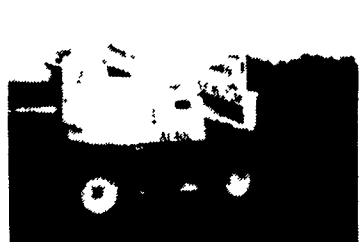
1988 Simon 4x4, 40' Manlift, 2200 Hrs., Rotating Basket.....$17,900