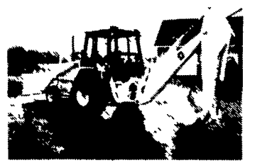
1989 JD TLB, low hours, clean.....$24,500

Gehl DM54 4x4 Forklift.....$22,000 1988 JD 550G w/6-Way Blade, 80% U.C., Nice.....$33,000 Cat D3C LGP Ford 655A TLB