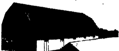
Use on Barns Or Garages