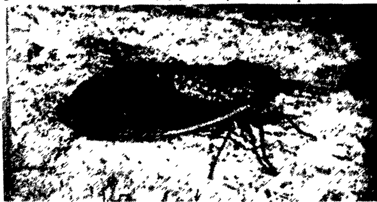
Both male and female 17-year cicadas measure about 1½ long. They are similar to the more common annual cicadas, the Dogday Harvestflies, which are actually larger, measuring up to about 1½ inches, according to Elkner. There are actually about six species of periodical cicadas, three with a 17-year cycle and three with a 13-year cycle.

during their long stay under- adults. A wasp, called the cicada ground. Birds will consume the killer, is another predator.