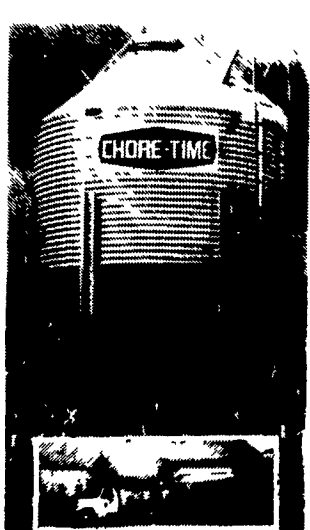
Call for pricing on bins assembled and delivered to your farm