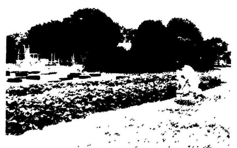
Jean picks strawberries from her weedless garden. She uses black plastic to keep the weeds down in the cantaloupe and watermelon hills.