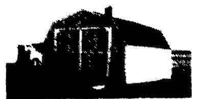
Storage Shed Built To Order

Custom Homes, Pole Buildings and Horse Barns, Concrete, Masonry and Carpentry Work