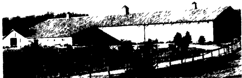
72 x 180 Indoor Arena with 20 Stall Barn

139 Churchtown Rd., Narvon, PA 17555 (717) 768-8606 (717) 768-3264 FAX