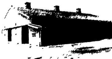
80x100 Riding Arena w/2 Rows of 10x12 Stalls