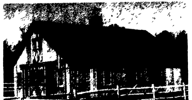
30 x 40 4- Stall Barn