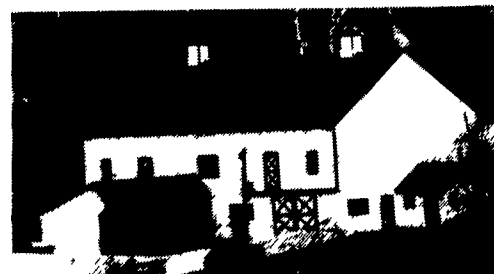
48 x 72 Bank Barn

Whether your need may be a small barn or a large equestrian center, give us a call and let our experience work for you