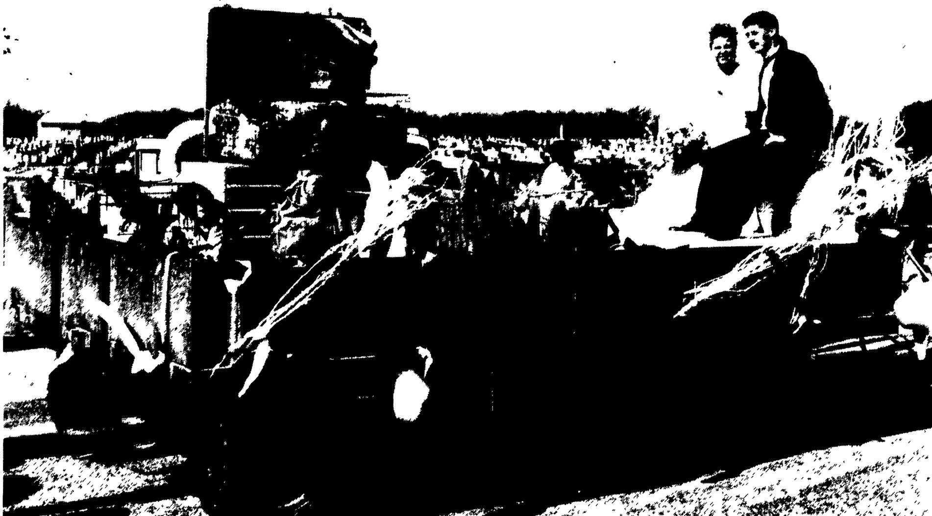
The newly-wed couple were surprised to find this mode of transportation awaiting them at the church door. The wagon-load of loot included a goat, a sheep, several chickens, a bed room suite and odds and ends to set up farming in the fast lane.