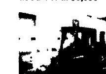
CASE 1835B SKIDSTEER New Rubber - Diesel - 2700 Hrs. Nice Clean Machine $8,500