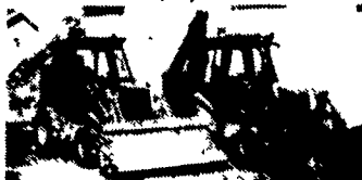
(2) Case 580K, 4x4's Extenda-hoes - EROPS, Low Hrs., - Radios, Nice Clean Tractors 1987-88-90