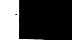
HUBER MAINTAINERS M-52 Gas.....$3,800 M-600 Gas.....$7,500 M-700 Gas, Cab & Loader...$11,500 We Buy & Sell Huber Maintainers For Parts M-52's-500's-600's-700's-800's