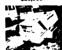
IR - 185 CFM 4 Cyl., JD Diesel, Good Cond. $5,500