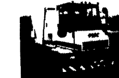
89 FMC Vanguard 4000 Sweeper, Diesel, A/C, R&L Gutter Broom $12,500

Dealer For Red Line Electric Brake Parts & Trailer Hitches. All Types Of Hitch Accessories.