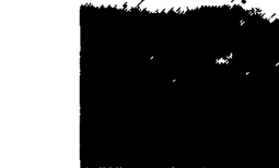
TRENCHERS (2) 3210 Ditchwitch Duetz Diesel's 5' Bar - P/A Frt Blade w/Tilt, V. Good Units $6,850 Ea. (1) 1420 Ditch Witch Walk Behind 3' Bar - 14 HP Kohler, Exc. Cond.