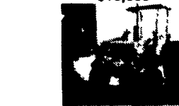
JD 401C Loader Tractor Diesel 3 Pt. - PTO - Rear - Outlets Nice Clean Tractor $9,500