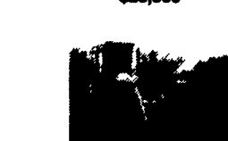
1976 Clark 301P Grader, Power Shift, 4x4, Detroit Diesel, EROPS, Heater, Scarifier, Tilt Mold Board Austin Western 100 Pacer, Detroit Del, 4x4, Cab, New Tires Austin Western Super 300, Cummins Del., 6x6