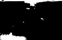
1976 Clark 301P Grader, Power Shift, 4x4, Detroit Diesel, EROPS, Heater, Scarifier, Tilt Mold Board Austin Western 100 Pacer, Detroit Del, 4x4, Cab, New Tires Austin Western Super 300, Cummins Del., 6x6