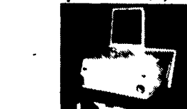
Tennant Sweepers Your Choice $5,500 Each (1) Model 92 Gas (2) 250's (1) Gas (1) LP (2) 255's Gas (1) 265 Gas Some w/High Dump Option