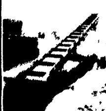
Downspout Attachment, PTO, Good.

Used Grinder Mixer Same as IH with Hyd. Intake Auger, Hyd. Position Control On Unload Auger, Scale Ask For Amos Sr.