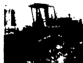
With Cab UM 3403

Hesston Self-Propelled Model 6550 Mower Conditioner with 14' Cut