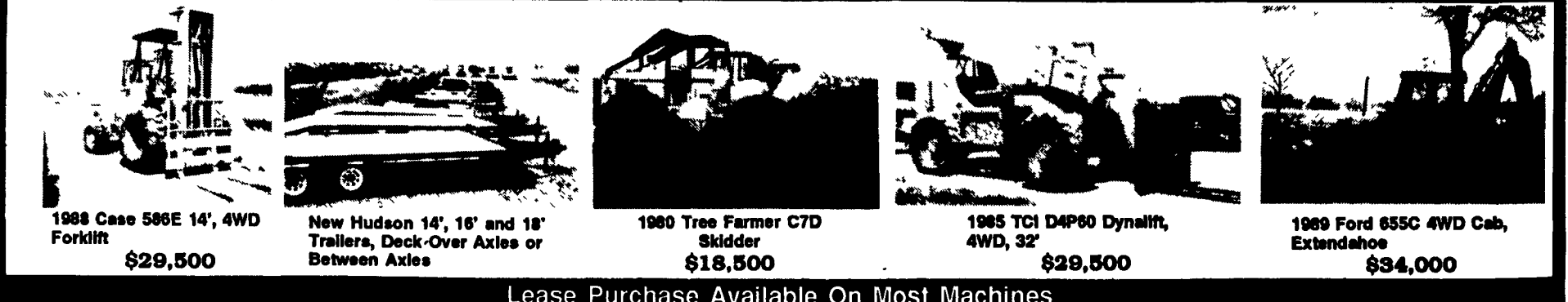
1988 Case 586E 14', 4WD Forklift $29,500 New Hudson 14', 16' and 18' Trailers, Deck-Over Axles or Between Axles 1980 Tree Farmer C7D Skidder $18,500 1985 TCI D4P60 Dynalift, 4WD, 32' $29,500 1989 Ford 655C 4WD Cab, Extendahoe $34,000

SALES STAFF: Monroe Buffenmeyer, Lloyd Wenger, Dave Wenger Construction Equipment 831 South College St., PO Box 409, Myerstown, PA 17067 717-866-2130 HOURS: Mon.-Fri. 7:30 to 5:00; Sat. 7:30 To Noon NIGHTS PHONE: 717-866-7147, 717-273-9089 FAX: 717-866-4300