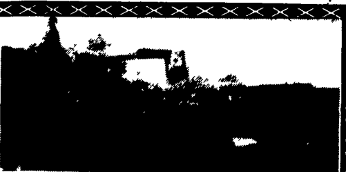
John Deere JD410 Wheel Loader Backhoe w/ROPs. $11,000

Heavy Equipment Loader Parts, Inc. 10070 Allentown Blvd., Grantville, PA 17028 (717) 469-0039 (800) 446-0505