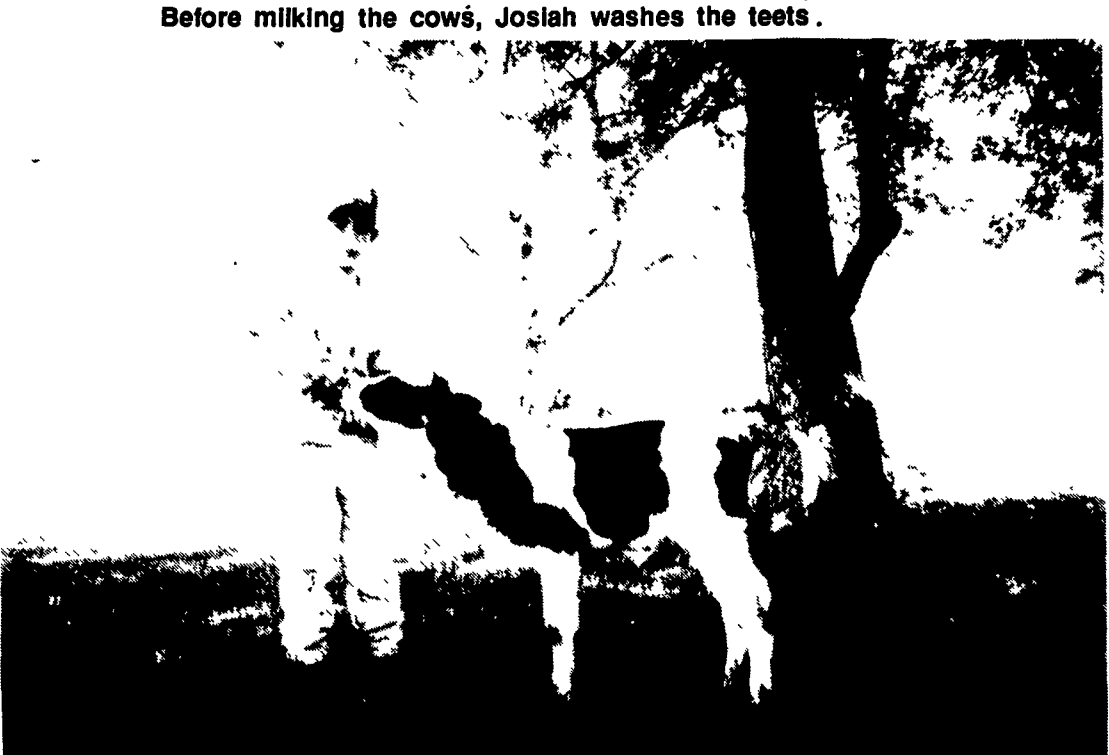
Barn chores often includes bottle feeding calves.