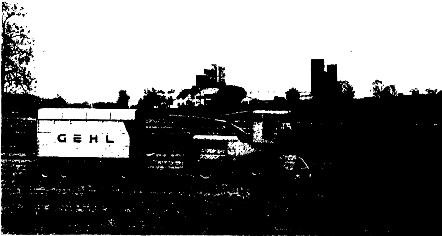
A normal farm scene this week had machines scurrying through the fields trying to get work done between showers. The photograph above was taken along State Road, north of Route 283 on the way to East Petersburg, in Lan-

By calling to classify, members help the Holstein Association save time and money, which will lower costs for members in the long run. To sign up for classification, or to find out more about the different classification options, call a Holstein Association Member Service representative at 1-800-952-5200.