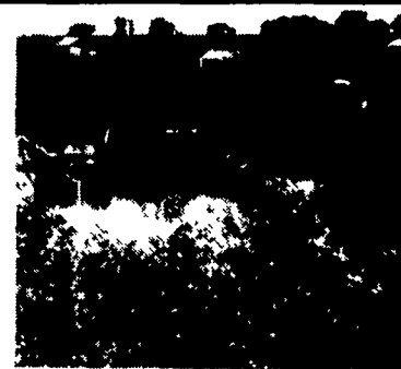
Tandem Hay Rake Hitch