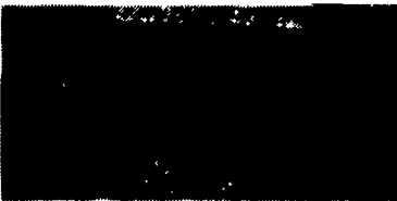
Round Bale Carrier Can Load w/ 3 PT. Spear