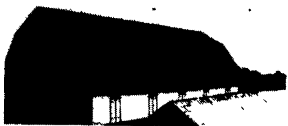
Use on Barns Or Garages