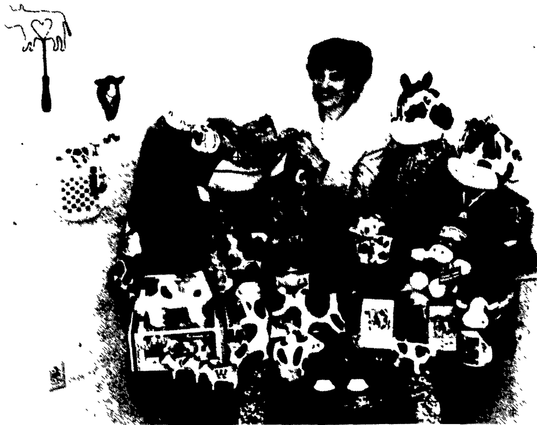
Lou Ann Good, staff writer, shows off prizes to be given during the Cow Mania Drawing in June. Winners will be selected by drawing. For details on entering the drawing, carefully follow the instructions below. Deadline for entries is June 1.