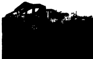
1980 Tree Farmer C7D Skidder $18,500