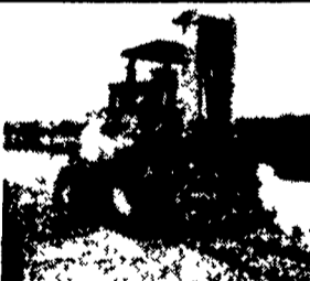
1988 Case 586E 14', 4WD Forklift $29,500