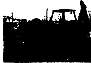
1979 Case 580C, ROPS $12,750