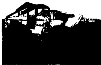
1980 Tree Farmer C7D Skidder $18,500