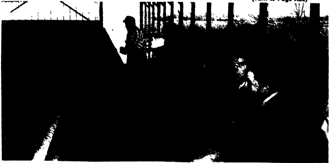
About 25 percent of the diet for the steers is made up of the party mix, providing a high carbohydrate, high protein supplement. In addition, the steers are fed a urea protein supplement in addition to high moisture corn, silage, and haylage.

After the snack food plant tour, FFA members, teachers, and cooperative council members (Turn to Page A22)