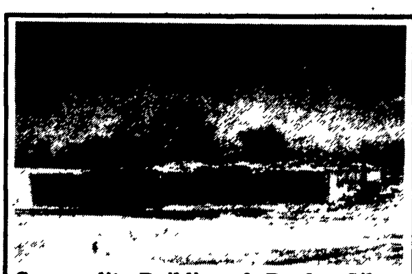
Commodity Buildings & Bunker Silos