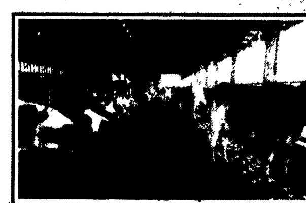
Slatted Free Stall Barn