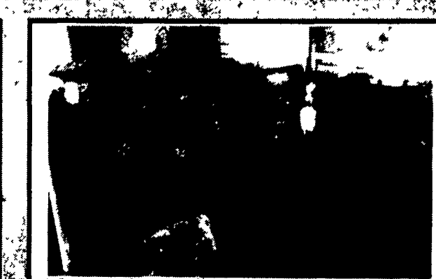
Slatted Beef Barn