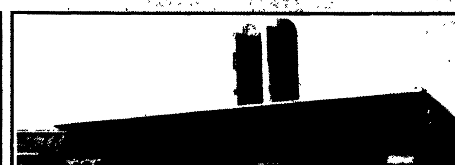
Slatted Heifer Barn