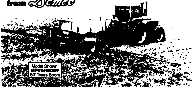
Model Shown HPT500DF 60' Truss Boom