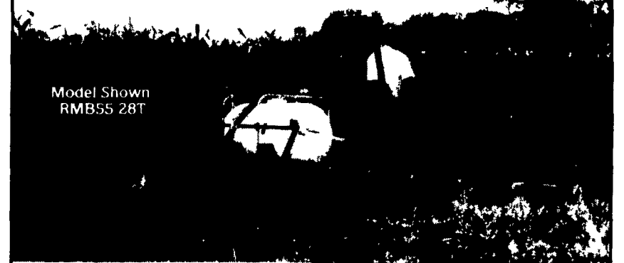
Model Shown RMB55 28T