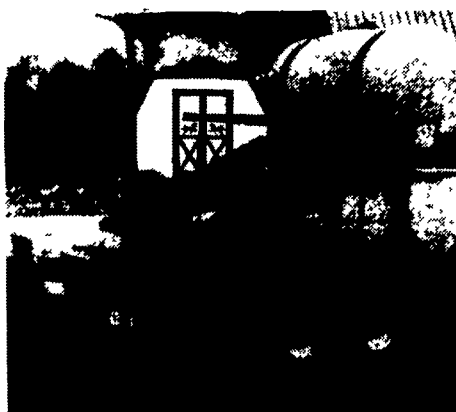
Model 1400 Planter