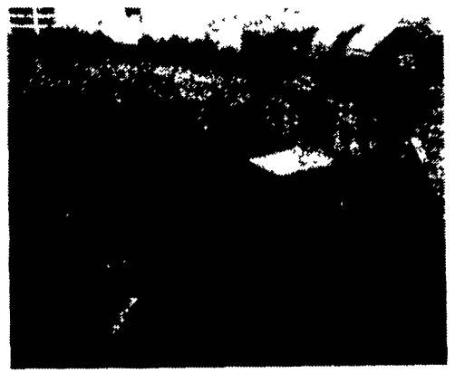
Raised Bed Mulch Layer Model 2500