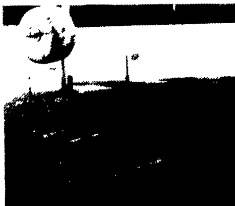
Flat Bed Mulch Layer, Model 560