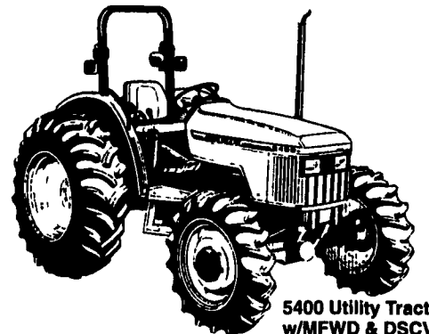
5400 Utility Tractor w/MFWD & DSCV