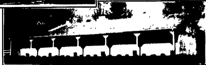
HORSE STALL BARN