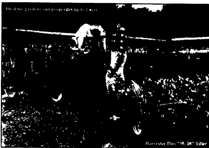
Harvester and Harvester Plus with 20" tillers

For larger gardens, the Harvester offers more power and the options that serious gardeners expect. With an adjustable 20" or 26" tiller, the Harvester is designed to get the job done fast. Featuring the 7hp Industrial/Commercial engine, with cast iron sleeve, the Harvester makes easy work of all your gardening chores.