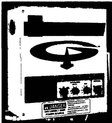
Alliance Unloader Control Panel