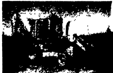
IH 270A, Good Cond. $8,000

Custom Repairs On All Makes Industrial & Farm Equipment