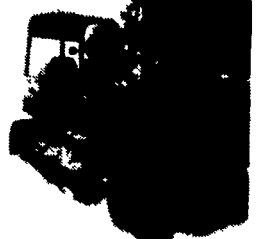
JD 455E New Tracks, Good Cond. $22,000

WE ARE BUYERS FOR CONSTRUCTION EQUIPMENT NEEDING REPAIRS