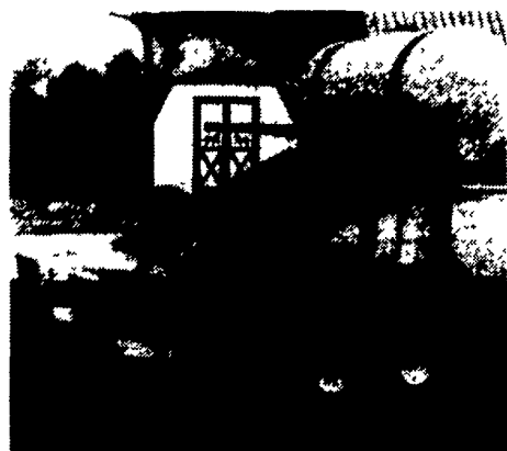
Model 1400 Planter