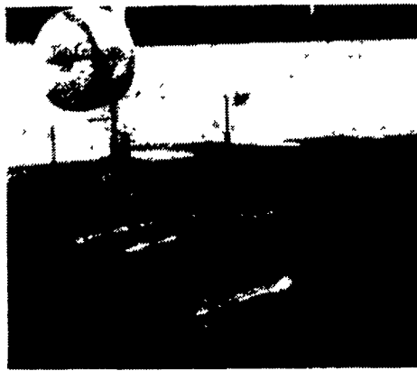
Flat Bed Mulch Layer, Model 560