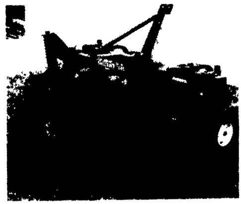
Automatic Reset Mulch Lifter