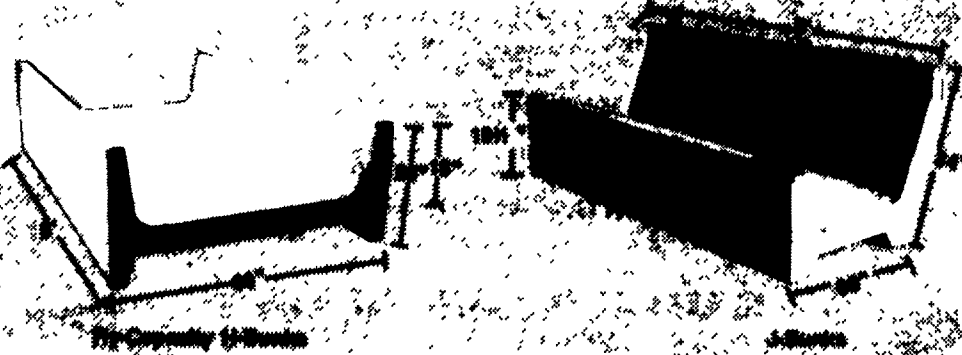
End Sections Available For Feed Bunks

Give us a call for more information on any of our products and services.