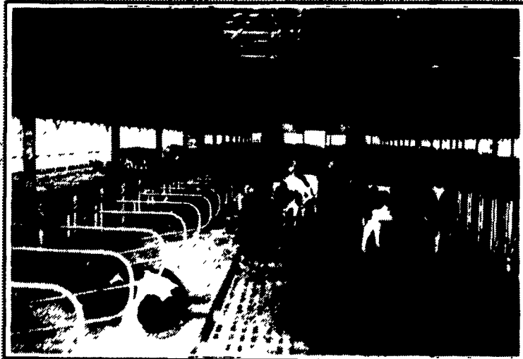
Long Core Concrete Water Wash