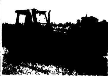
1981 Allis Chalmers 714B w/3 Pt. Hitch, 2800 Hours, Sharp