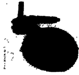
Good Used Spring Loaded Plow Colters to Fit Most Plows Inc. IH, WH, OL, FO, JD, etc.