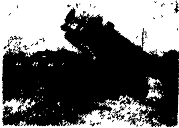
John Deere 235 18' Centerfold Disk, Very Good Condition, Black Gang