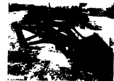
International 2250 Loader With Brackets to fit 574, 674 etc. Complete w/Valve.