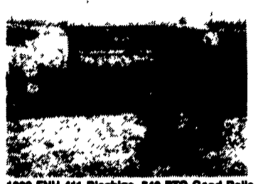
1982 FNH 411 Discbine, 640 PTO Good Rolls, Good Condition.