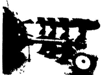
International 155 4x16 Rollover Plow w/On The Land Hitch.