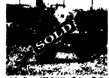
John Deere 672 8 1/2' Hay Rake w/Dolly (Sharp).