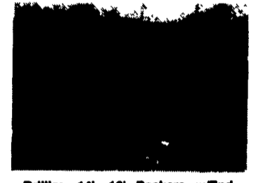
Brillion 14', 16' Packers w/End Transport