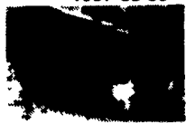
Lull 844 Forklift, 4WD, 4 Whl. Steer, 34' Lift, 8,000 Lb. Capacity $27,500