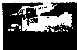
GRADALLS G-440 - Ford Gas Down Det. Diesel Up Remote; $12,500 G-600 - Det. Diesel Up & Down Remote $8,500