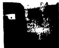
RUBBER TIRE ROLLERS 1979 Gallon 9 wheel, Diesel, Good Cond $6,500 Gallon 9 wheel gas $2,500