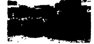
(1) 1987 L-9000 FORD 240 H.P. Cummins, Low Mileage, 7 Speed Trans., Cent. Hyds. Set Up For P/A Snowplow & Salt Spreader & 20 Ton Tag Trailers, 36,200 GVW