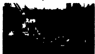
NEW CUSTOM TRAILERS IN STOCK 3-Ton Tilts E/B; 4-Ton Tandems E/B; 20-Ton Tandem A/B