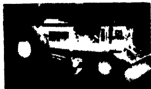
HUBER MAINTAINERS M-52 Gas .....$3,800 M-600 Gas .....$6,500 M-650 Diesel, Front Blade, Wide Tires We Buy & Sell Huber Maintainers For Parts M-52's-500's-600's-700's-800's