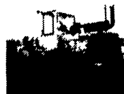
1983 Clark 55C, 4WD Loader, EROPS, Detroit Diesel $23,500