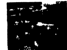
FORD 2110 TRACTOR Side Sickle, Gas, 3 Pt. PTO, 8 Spd., Low Pro. $4,750