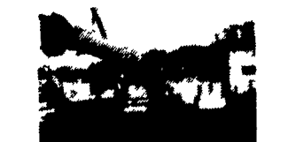
CRANES - CHERRY PICKERS 125 Gallon - Gas 60' Boom Cab - 4x4 - 12 1/2 Ton $10,000