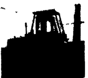
1987 Case 586E Forklift, 14' Lift, Cab, Heater, 4WD, Low Hrs. $28,500