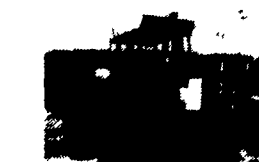
4386 Int 4x4, 2450 Hrs., 3 Rear Outlets, Cab, C&P, Nice Tractor $17,500