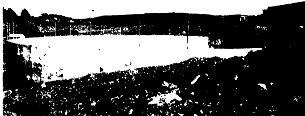
12' x 83' Diameter Circular Manure Storage

Specializing in Manure Storage with Top Protection Below and/or Above Ground