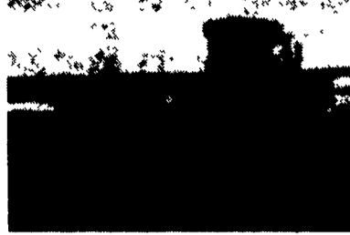
JD 644B 4 1/2 Yard, New Tires, Good Cond. $22,500.00