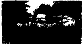
IH 600 Planter