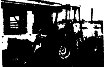
International 515, Good Cond. $13,000

WE ARE BUYERS FOR CONSTRUCTION EQUIPMENT NEEDING REPAIRS