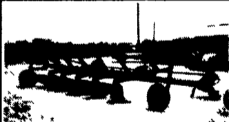
Ford 5x18 Spring Reset Plow On Land