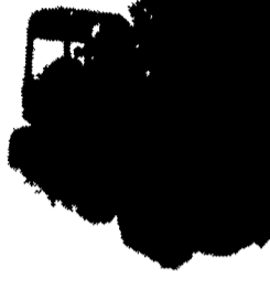
JD 455E New Tracks, Good Cond. $22,000

WE ARE BUYERS FOR CONSTRUCTION EQUIPMENT NEEDING REPAIRS