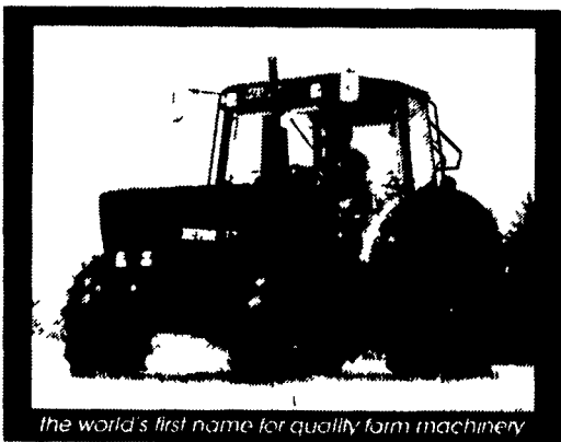
the world's first name for quality farm machinery

Mfg. List Price $36,249 SALE PRICE $32,950