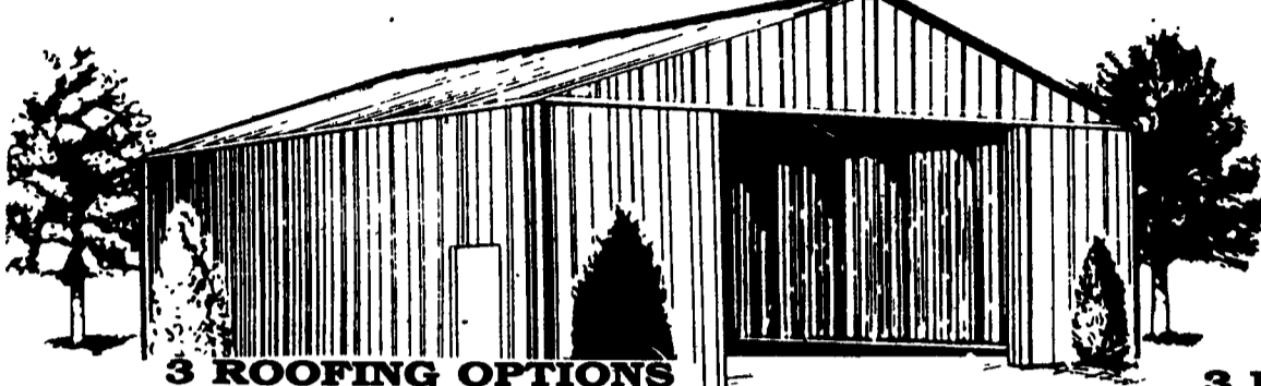
3 ROOFING OPTIONS

CONSTRUCTION • Pressure treated posts & skirt boards • 2x4 Premium grade girts & purlins • Prefabricated clear span trusses 4' On Center • Sliding doors w/National hardware • 3°6' Prehung door • Also includes all nails, hardware, trim, plans and instructions • 29 Gauge Fabral Painted Steel Siding