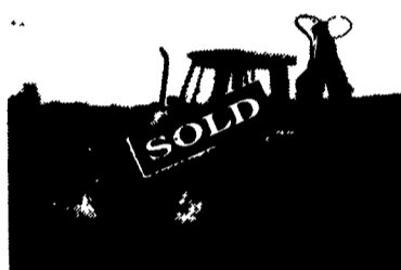
Case 580K TLB 4x4, extend-a-hoe, excellent condition.....$28,000

JD 450C Crawler Loader w/Backhoe, Good Cond.....$13,500