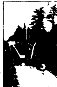
TRANSPORT AT 11'2"

Make Your Buying Decisions Now For A New Kinze Planter And Plant A Good Crop