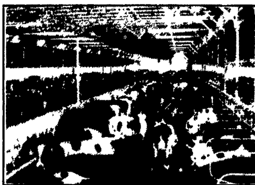
Free Stall Barn Interior