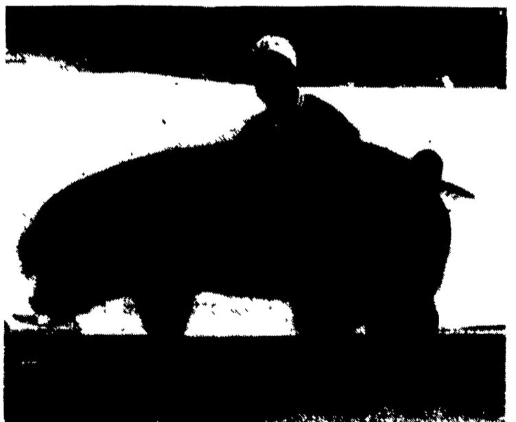
Dave Holloway exhibited the reserve champion Duroc at the Farm Show last week.