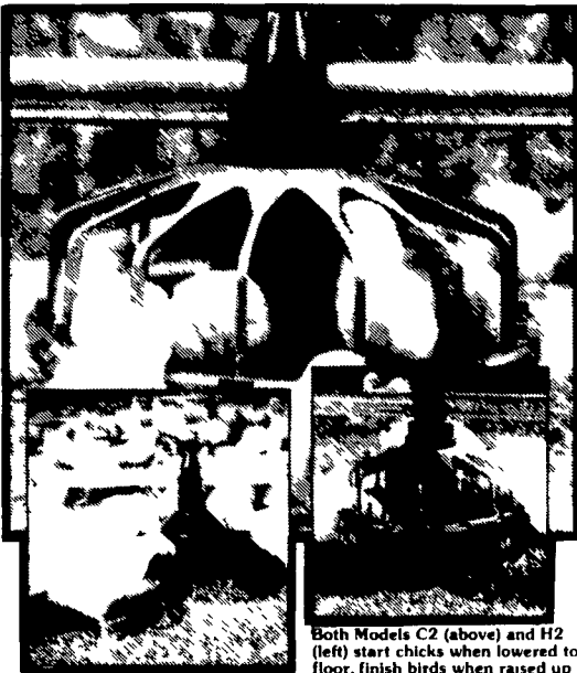
Both Models C2 (above) and H2 (left) start chicks when lowered to floor, finish birds when raised up