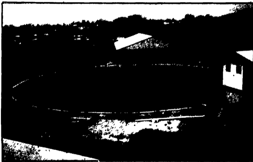
Partial In-Ground Tank Featuring Commercial Chain Link Fence (5' High - SCS approved)