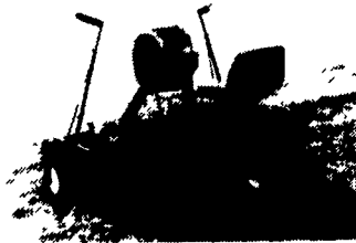
SUPER DELUXE FLATBED MULCH LAYER