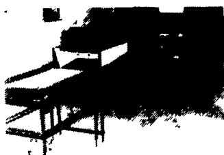
FRUIT & VEGETABLE PACKING MACHINERY