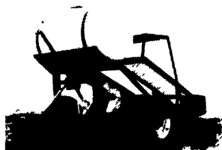
MODEL P150T WATER WHEEL PLANTER