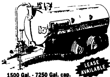
1500 Gal. - 7250 Gal. cap.