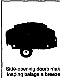
Side-opening doors make loading baleage a breeze!