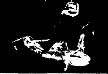
JD F930, 24HP Onan, Hydrostatic 1250 Hrs., 72" Front Mower, Was $5,500 Now $4,900