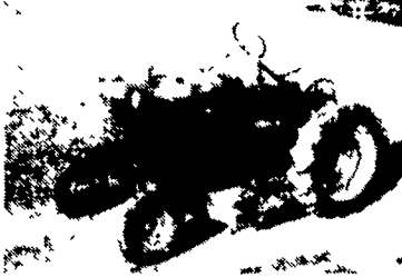
Farmall Cub w/Mid Mower, Sickle Bar Mower, 1 Bottom Plow, Manual Lift, Was $2,200 Haul Away $1,900