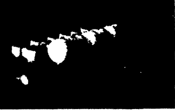
White 5100, 6RN Planter, Air, 540 Pump, Markers, Monitor, Liq. Fert., Insecticide, Was $6,800 Tow Away $5,500