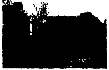
Butler 2300 Spreader Tank, 2300 gallon, T/A Flot. Tires, Used Very Little $3,200

OTHER USED EQUIPMENT IH 600 Blower Was $1,800 .....Tow Away $1,200 FNH 489 Haybine New Rolls. $5,500 Hub 36' Elev. w/Motor like new .....$1,900