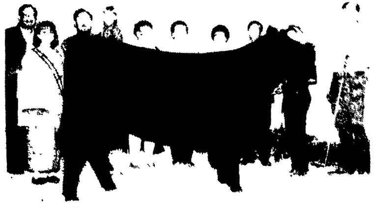
Grand champion female honors were awarded to Ankony Pride V714 at the 1995 Virginia State Fair Angus Show in Richmond. Clear View Farm, Louisa, owns the February 1994 daughter of N Bar Emulation EXT. She first topped the entries in the junior division.

Grand Champion Bull - Hill Crest Viper 033, exhibitor Annfield Corporation, Boyce, VA;